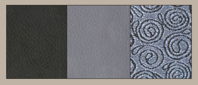
CRACKED PEPPER DECOR