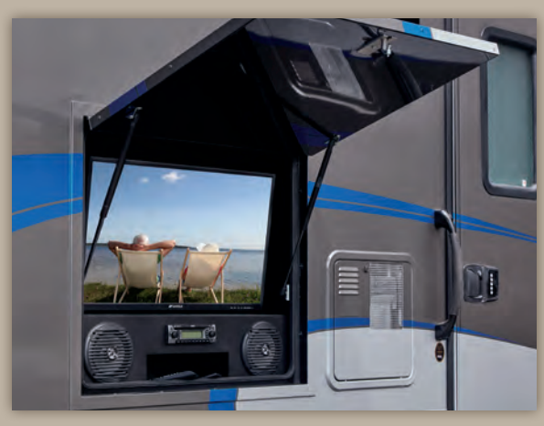
The standard outside entertainment center features a 32" LED TV with remote, AM/FM/CD/DVD with blue-tooth connectivity and speakers and conveniently located under your patio awning.