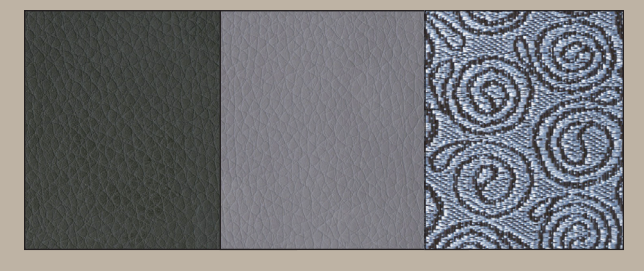
CRACKED PEPPER DECOR