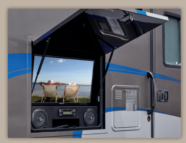
The standard outside entertainment center features a 32" LED TV with remote, AM/FM/CD/DVD with blue-tooth connectivity and speakers and conveniently located under your patio awning.