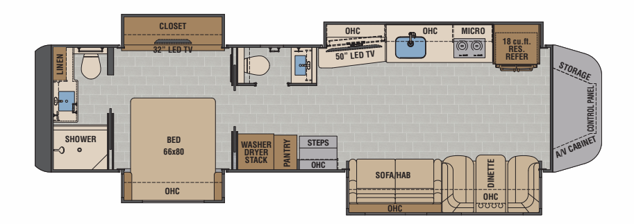
X43DB 43' mid entry quad slide