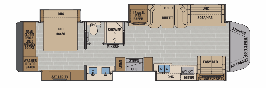
X45QS 45' mid bath, rear closet quad slide