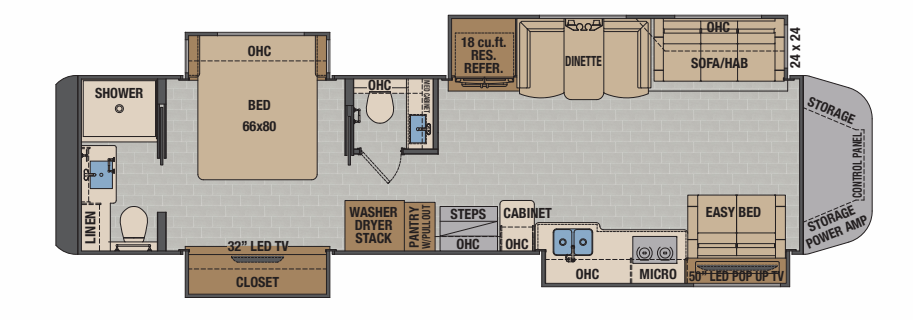
X45DBM 45' mid entry quad slide