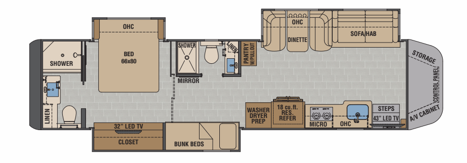
X45BBC 45' front entry 3 slides